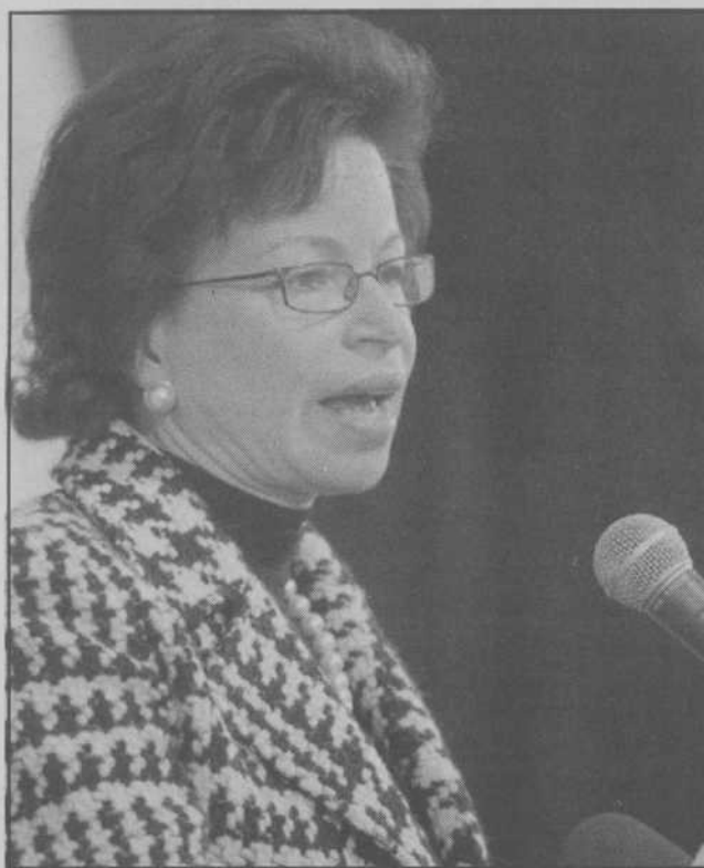
Valerie Jarrett has known President-elect Barack Obama for much of his political career. She's based in Chicago.

"Or, now from Rahm Emanuel. So the five people who actually do know the names on the list, you haven't spoken to them. So what I think you see in the newspaper is what everybody speculates. I haven't seen the list but my guess is they're speculating on the