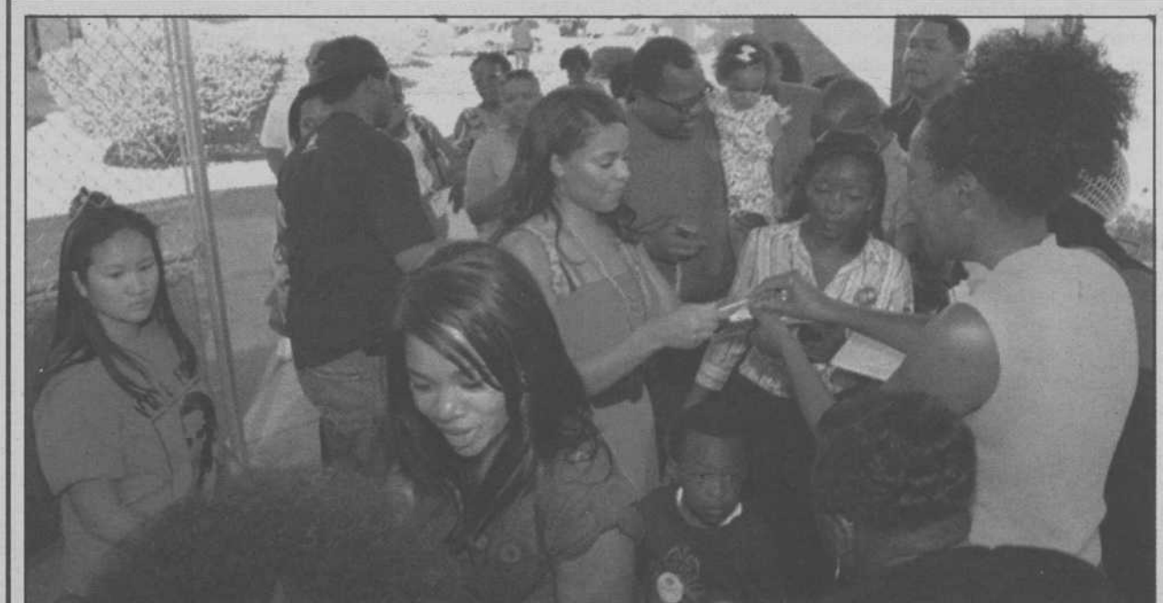
VOTING LADIES Veteran actresses Sanaa Lathan and Regina Hall, center, mixed and mingled with guests at the West Las Vegas Arts Center Amphitheater on Sunday after campaigning for Democratic presidential nominee Barack Obama.