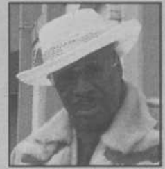
Rudy Ray Moore