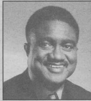
GEORGE E. CURRY

He blocked the nomination of federal judges with whom he disagreed, held up funds to the United Nations as chairman of the Foreign Relations Committee, conducted a 16-day filibuster against establishing the Martin Luther King federal holiday, opposed the 1964 Civil Rights Act, voted against the Voting Rights Act of 1965, railed against AIDS as a gay disease (he later softened his view on AIDS) and in 1990 boycotted Nelson Mandela's address to a joint session of Congress.