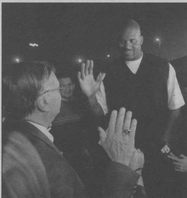
In this Jan. 5, 2006, file photo, Shaquille O'Neal is sworn in as a special deputy captain with the Maricopa County Sheriff's Office by Sheriff Joe Arpaio in Phoenix, Ariz.

He also volunteered with the Tempe Police Department after being traded to the Suns in February.