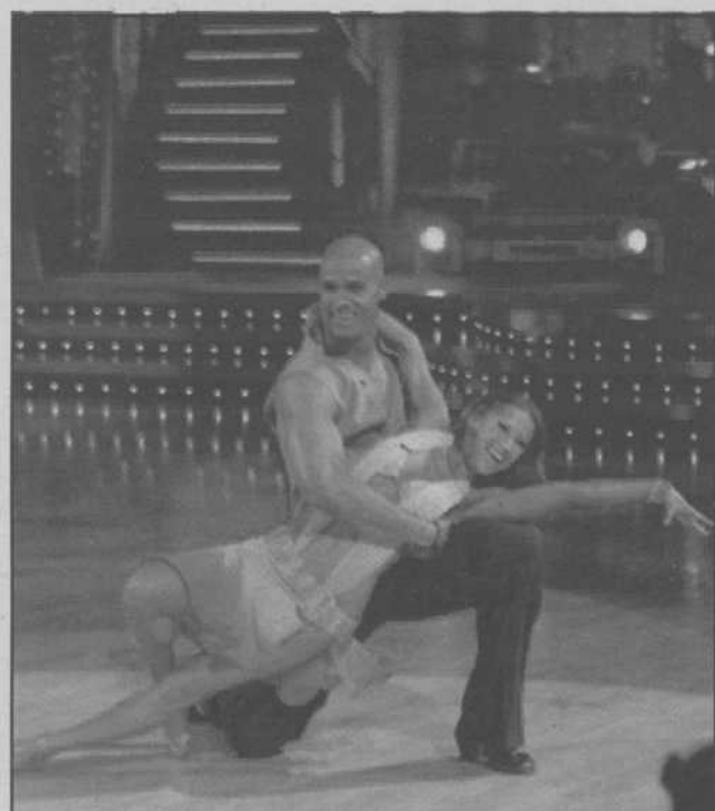
Jason Taylor and Edyta Sliwinska on "Dancing With The Stars." The NFL all-pro's Miami career might be over.

• KUJICHAGULIA — Self-Determination • UJIMA — Collective Work & Responsibility •