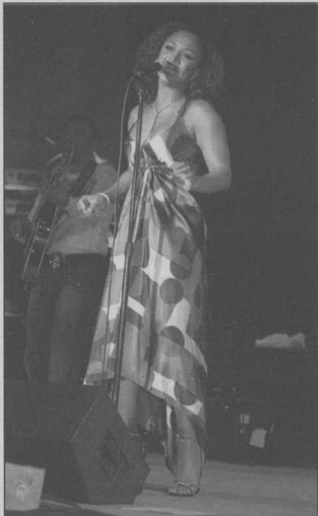
Chante Moore sings a fluid, melodic ballad.