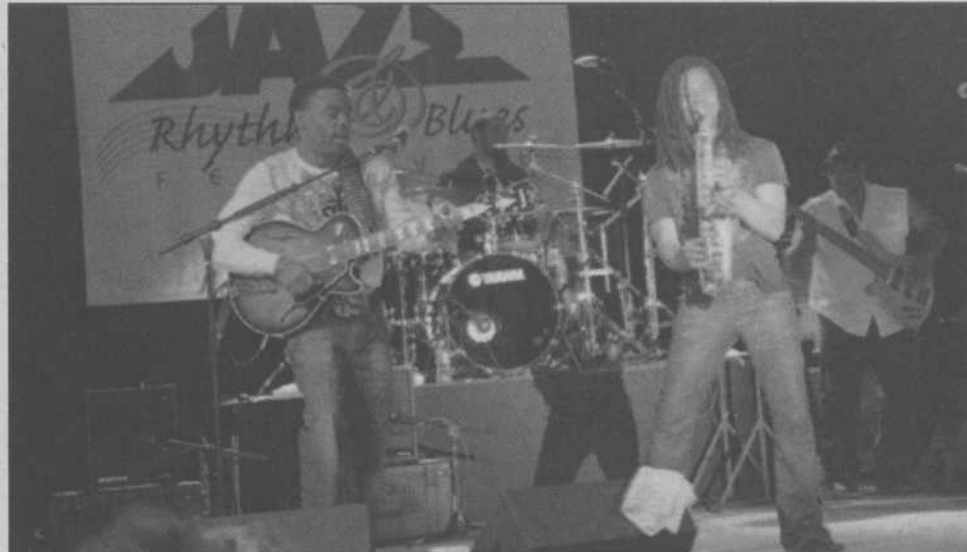
Norman Brown, left on guitar, and Paul Taylor rock the house with soul rhythms.