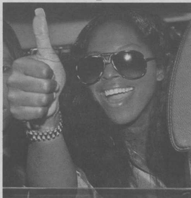
Foxy Brown gives the thumbs-up on her prison release.

"The hardest part was people's perceptions of me," she said. "I had officers who were wonderful and the inmates showed me — you'd think Barack [Obama] was in the building when I walked through. They showed so much love, it was so incredible. But I had situations with officers who, you know, only