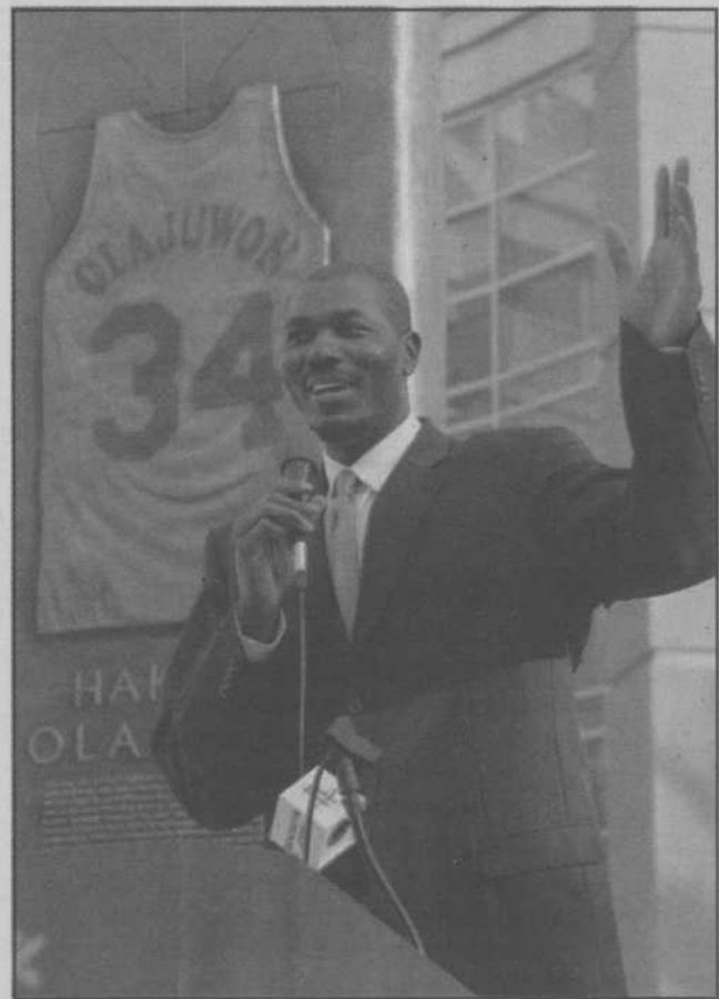
NBA Hall of Famer and former Houston Rockets center Hakeem Olajuwon unveils a sculpture outside Rockets arena Friday in Houston. Olajuwon won two NBA titles.

UMOJA — Unity • KUJICHAGULIA — Self-Determination • UJIMA — Collective Work & Responsibility • UJAMAA — Cooperative Economics • NIA — Purpose • KUUMBA — Creativity • KUJICHAGULIA — Self-Determination • UJIMA — Collective Work & Responsibility