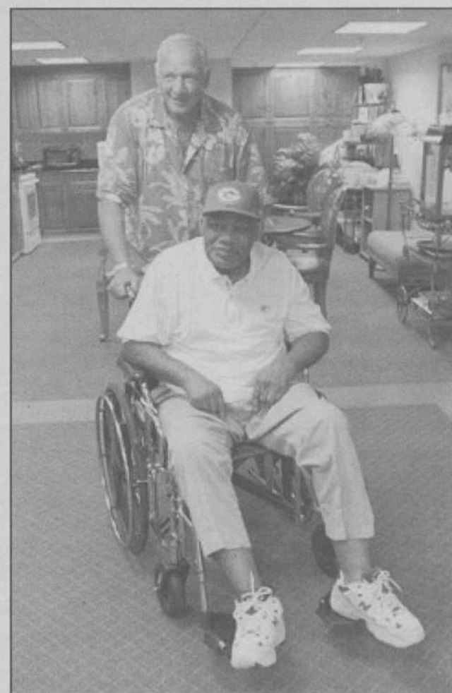
The House Judiciary Committee intends to hold more hearings on the benefits programs for retired NFL players.