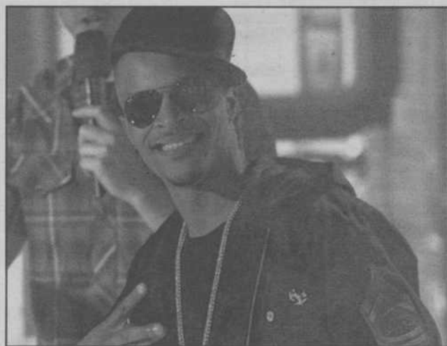
T.I. faces federal prison time for illegal gun possession.

Given that he originally faced a maximum of 10 years in the clink and a $250,000 fine for each count, that's not a bad alternative, especially when prosecutors seemed to be playing with a stacked deck. If the case had gone to