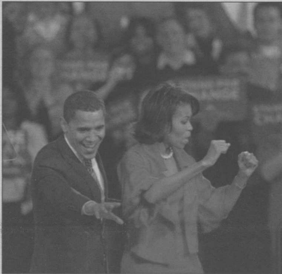
Democratic presidential hopeful Barack Obama and his wife Michelle celebrate with supporters on Super Tuesday in Chicago. Hillary Clinton and Obama dug in for a protracted slog for the Democratic White House nomination after battling to a brutal draw in their coast-to-coast Super Tuesday showdown. Obama won 13 of the 22 states up for grabs.

Obama said he had won a majority of the 1,681 delegates at stake, although The Associated Press tally showed several hundred yet to be allocated.