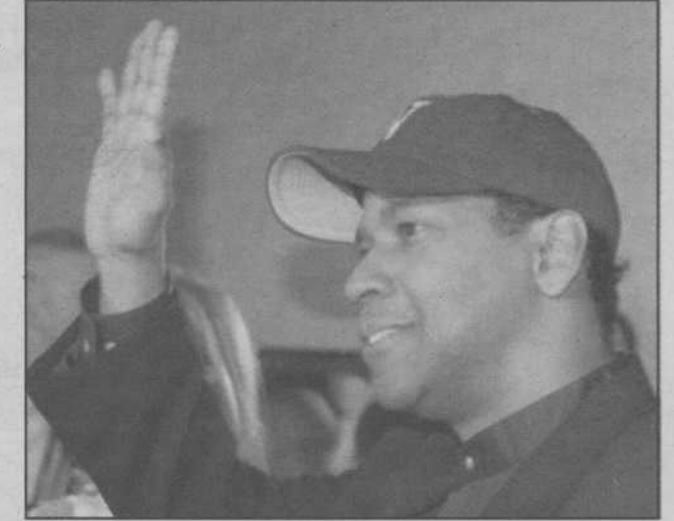
Denzel Washingrton recently visited Marshall, Texas.

guide explains every aspect of Kwanzaa, from its African roots, to its seven principles, to the ceremony, songs and feast, including recipes. While you might be unfamiliar with many of the African dishes, which have been culled from such countries as Cameroon, Zanzibar and Senegal, the instructions seem straightforward enough that you might enjoy making something unfamiliar to your palate. Otherwise, there are traditional West Indian and Southern soul food staples to pick from, including Caribbean rice and peas, sweet potato pone, collard greens, macaroni