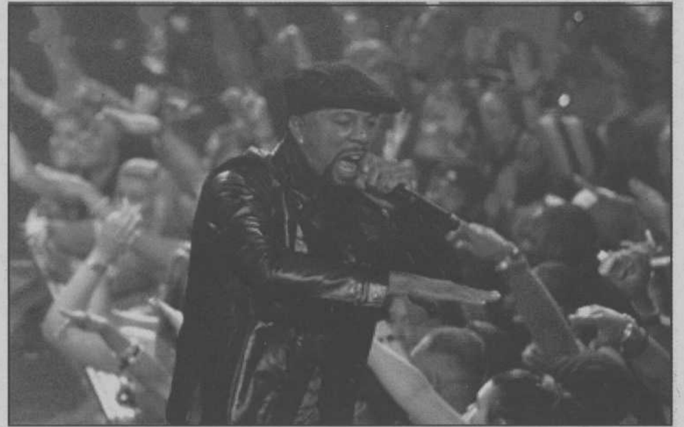
Common performs during the VH1 Hip-Hop Honors celebration in New York on Monday.

During the tribute to Whodini, Nelly and Jermaine Dupri did '80s dance moves while Whodini delivered their