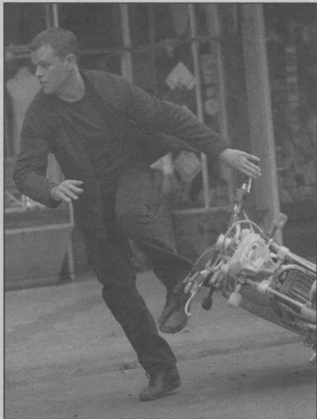
Matt Damon delivers the action in the "Bourne Ultimatum."

At the point of departure, we find Bourne under the radar in Russia but about to be outed in England by a front-page story in The Guardian. After its publication, he ventures to England to track down the investigative re-