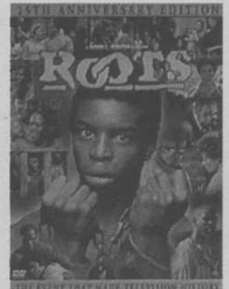
an eye-opening exposé on the evils of slavery, as it forced the U.S. for the first time to

The sweeping, genealogical saga sought to encapsulate the Black experience by telescoping in on the author's own family tree, starting in Africa in 1750 and ending in Arkansas a couple of centuries later. The show served as