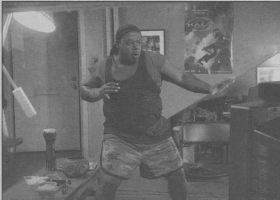
Cedric the Entertainer stars as Jake Rodgers in the forgettable "Code Name: The Cleaner."

In truth, she's in cahoots with a gang of crooks who are after an altered computer chip that they think Jake has in his possession.