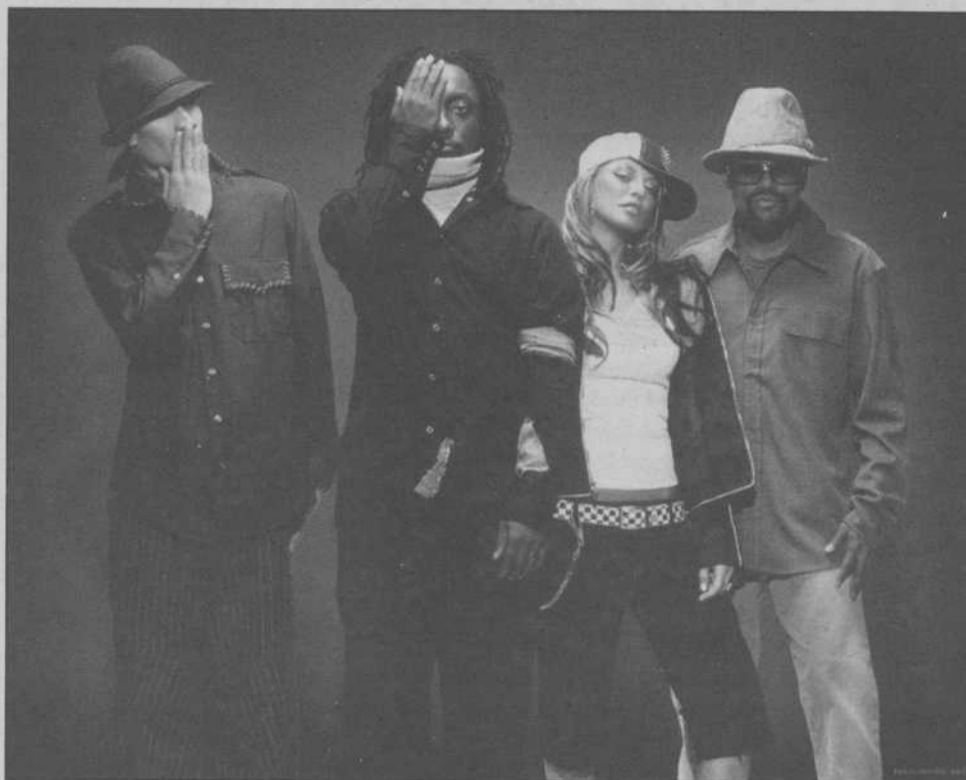
The multifaceted, multitalented Black Eyed Peas won three American Music Awards.