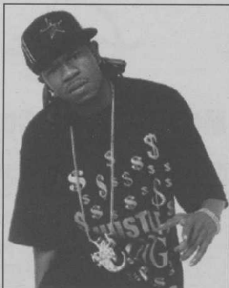
Chamillionaire had a good rookie season.

"The AMAs are one of my favorite awards shows. It's casual," Chingy said.