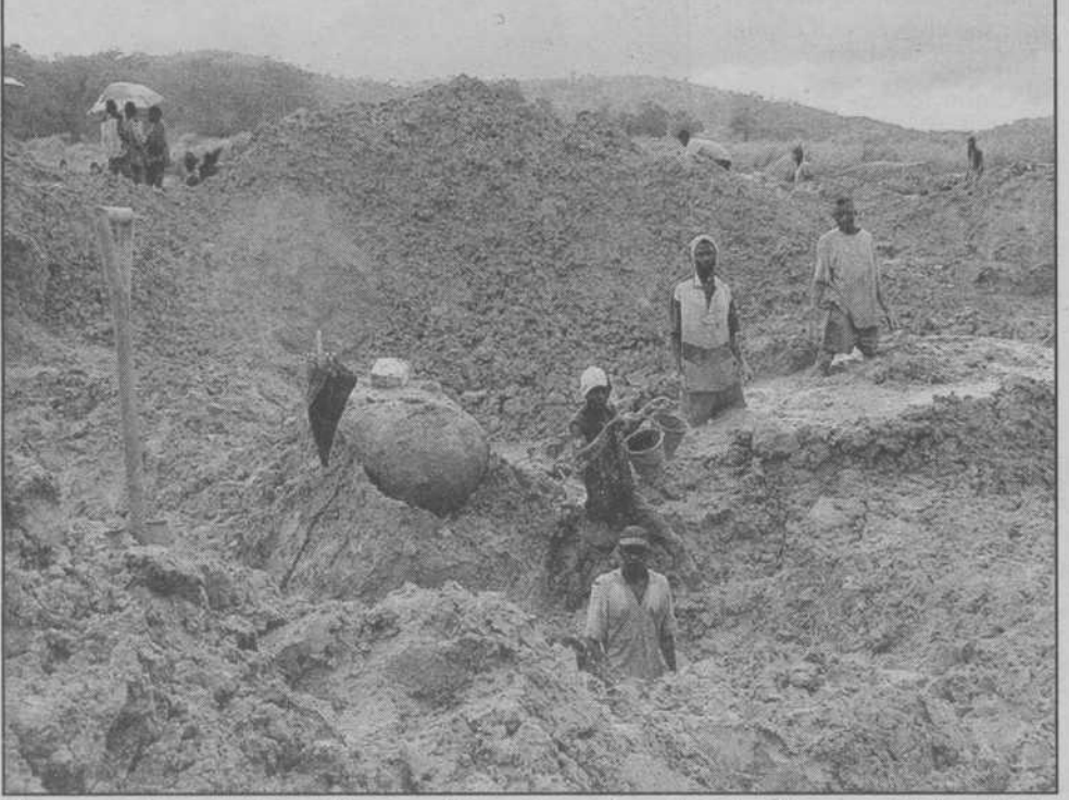
Diamond miners work hard to unearth precious minerals that will eventually be sold.

A 60 percent rise in diamond exports from Ghana