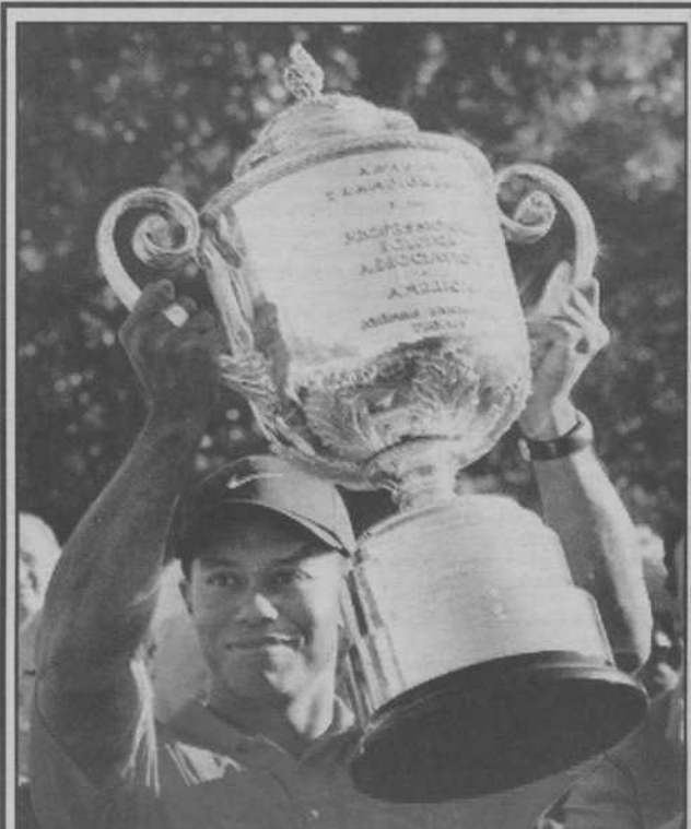
ANOTHER TROPHY Tiger Woods holds up the Wanamaker Trophy after winning the 2006 PGA Championship at Medinah Country Club in Medinah, Illinois, on Sunday. This was Wood's 12th major's victory. He's the world's top player.

UMOJA - Unity • KUJICHAGULIA - Self-Determination • UJIMA - Collective Work & Responsibility • UJAMAA - Cooperative Economics • NIA - Purpose • KUUMBA - Creativity • KUJICHAGULIA - Self-Determination • UJIMA - Collective Work & Responsibility