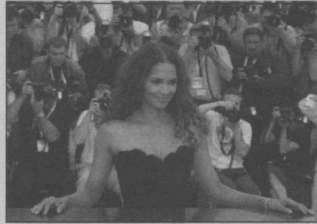
Academy Award winner Halle Berry poses during a photo call for "X-Men: The Last Stand," at the 59th International film festival in Cannes in the south of France on Monday.

"Are we having a racist moment here?" Berry, the first Black actress to win an Academy Award for a lead role, asked Moyles after she took exception to his impersonation. Moyles, who is