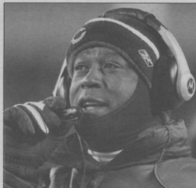
Chicago Bears' Lovie Smith was named NFL coach of the year for leading his team to a division title and the playoffs.

"You most certainly do have to say he is coach of the year," Rivera said. "We were supposed to be 3-13 according to a lot of people. We were supposed to be the 32nd-ranked team, and he got us to believe in ourselves and believe in each other. It's true." (See Smith, Page 15)