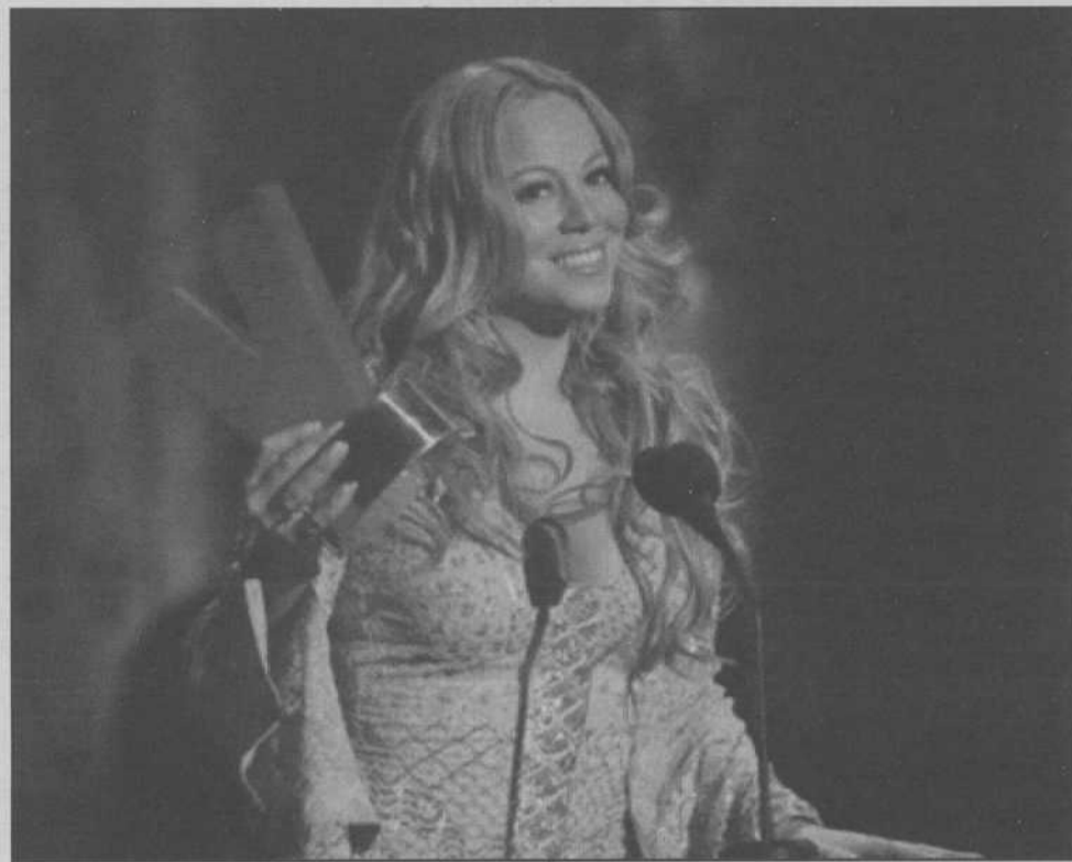
Mariah Carey accepts an award for best R&B song at the third annual Vibe Awards at Sony Studios in Culver City, Calif., Saturday. She took home four Vibe trophies in all.