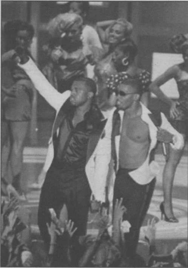
Rapper-producer Kanye West rejoices with actor-comic-singer Jamie Foxx during the MTV Music Video Awards.

"It's great to know that rock music still has a place at MTV," said lead singer Billie Joe Armstrong, speaking of hip-hop's recent take-