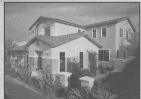
MODEL: Exterior 4B (Reversed)

Hurry to Dakota for our special Move-In Package! GE® side-by-side refrigerator GE washer and gas dryer 1" mini-blind package