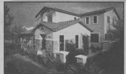
MODEL: Exterior 4B (Revised)