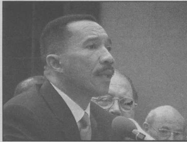
Former NAACP President and CEO Kweisi Mfume.

Mfume, who is unmarried, served as president and CEO of the NAACP for nine years. He acknowledges that he dated one female employee of the NAACP. He said he adopted that woman's