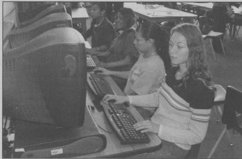
Students at Rancho High School give the new online remediation program a try.

The district announced the Important Day themed campaign as a companion effort