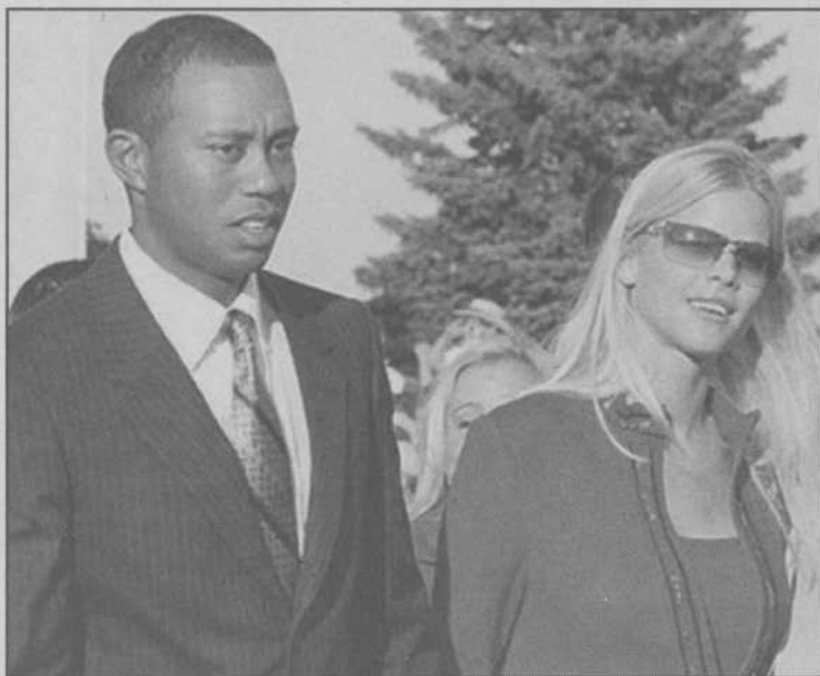
Tiger Woods wants to enjoy married life with his wife, Elin Nordegren.

Woods invited about 120 family and friends, including