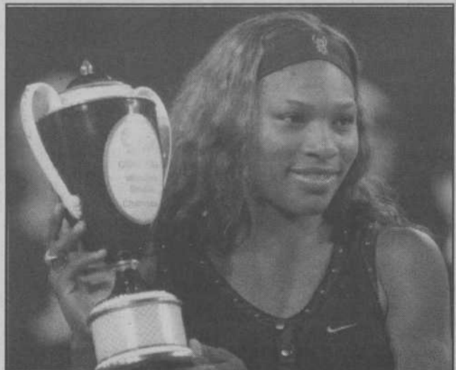
Serena Williams holds the China Open trophy after defeating Svetlana Kuznetsova in Beijing, China, Sunday.

Williams is working her way back up the WTA rankings after missing part of this year because of injury. She will remain at No. 10 despite the victory while Kuznetsova will stay No. 5.