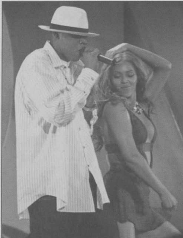
Jay-Z, left, and girlfriend Beyonce perform "Crazy in Love" during the BET Awards on June 24 in Los Angeles.