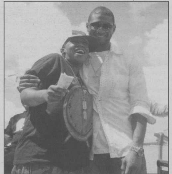
Singers Missy Elliott and Usher hug as they pose for photographers after they announced some of the MTV Video Music Awards nominees at a Tuesday ceremony in Miami.

"There's going to be a lot of muscle out there. So I'm going to have to have a sexy