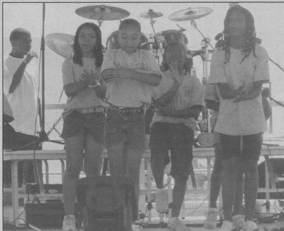
The Victory Missionary Baptist Church's praise step team performs a routine during Saturday's community clean up.

"We are grateful to you who have come out to participate and we want to thank the dignitaries assembled