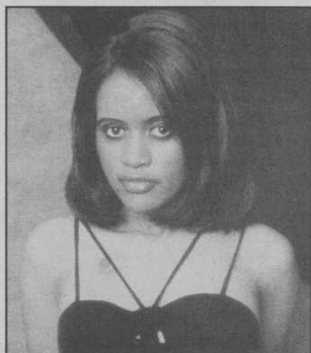
Princetta will fete Tina Turner in April.

The exotic steppin' brought the steppers to the floor. Intermingling with the crowd on the dance floor is