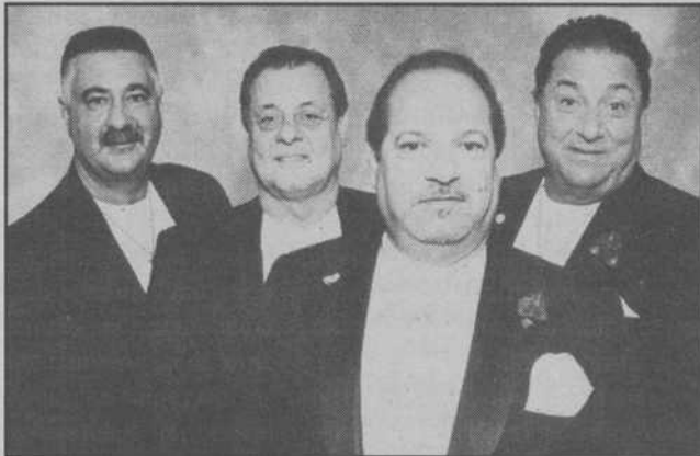
The Nitekings pleased the crowd with their March 26 show.

Hey, Hey, Hey! The lack of men didn't keep the fun-loving felines from hitting the dance floor.