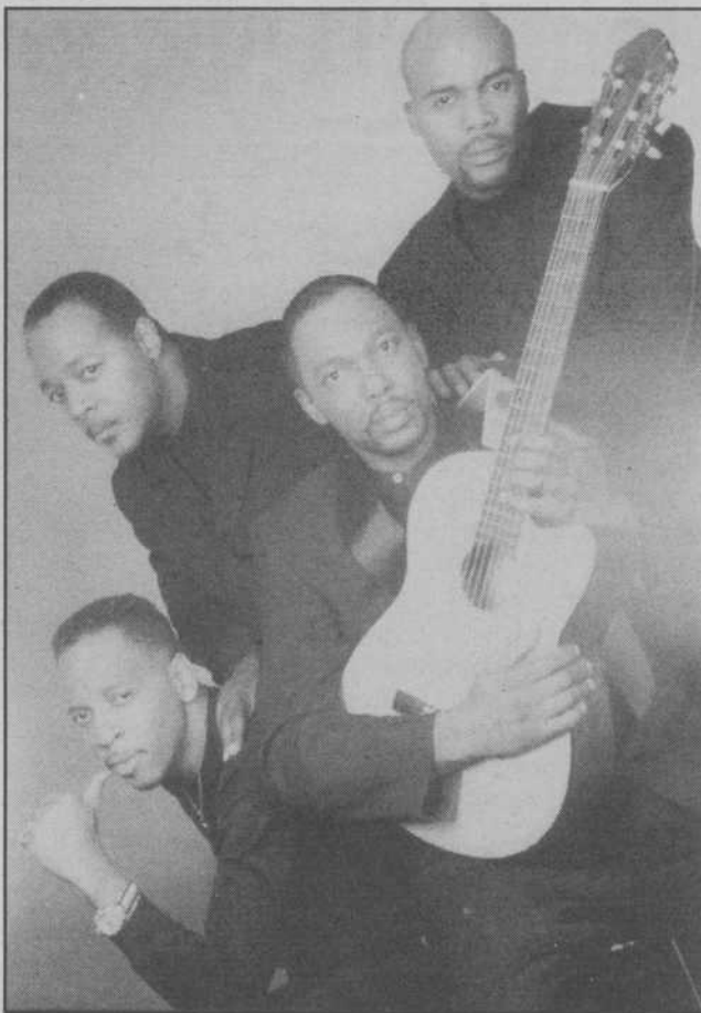
Jerry's Nugget hotel-casino has become a popular entertainment locale for booking acts like The Experience.

Dressed in white, the loose-fitting pants they wore were more than a clue that they might need a little legroom. Their choreography was high energy, well timed and rehearsed. This young group did a melody of hits by many famous groups, including The Temptations, Four Tops, Prince and the Godfather of