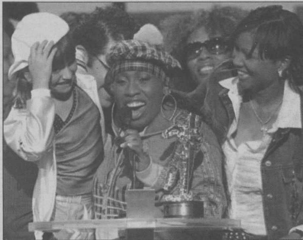
Missy Elliott accepts the MTV Video of the Year Award for "Work It" during the MTV Awards Thursday at New York's Radio City Music Hall. She is surrounded by people who collaborated on the video. (Below left) Rapper 50 Cent with date, actress Vivica Fox.

Proving they've come a long way from their Mouseketeer days, the young pop tarts