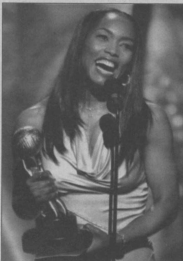
Actress Angela Bassett accepts the award for Outstanding Actress in a Motion Picture for her role in 'Sunshine State,' at the NAACP Image Awards in Los Angeles on Saturday.