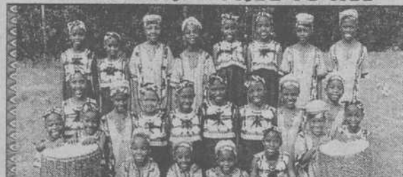
This group of 20-25 African children, ages 5 thru 12, were selected from thousands of orphans and disadvantaged children in Africa to tour the world spreading their message of hope and joy.

Jackson has routinely kept his children's heads covered (See Jackson, Page 13)