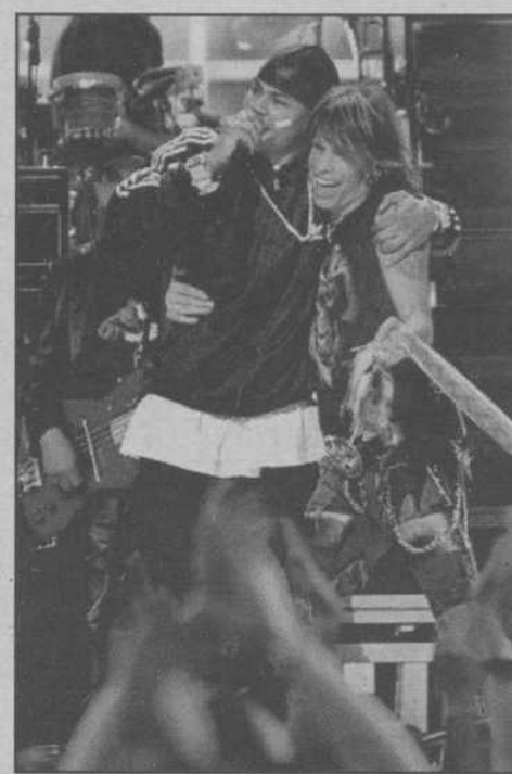
Rapper Nelly, left, and Steven Tyler of the rock group Aerosmith perform a tribute to slain Run-DMC DJ Jam Master Jay.