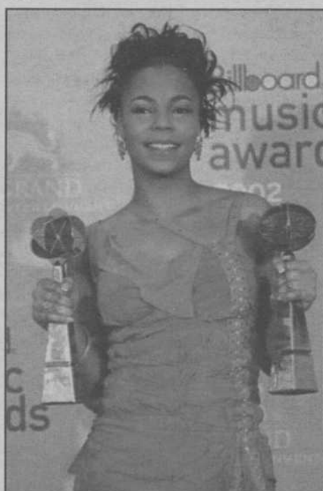
R&B singer Ashanti won 8 awards Monday, at the MGM Grand Hotel and Casino in Las Vegas during the Billboard Music Awards.

The Billboard Awards are determined by the magazine's year-end chart listings, which are based on record sales and airplay. Winners in several categories won't be announced until later this month.