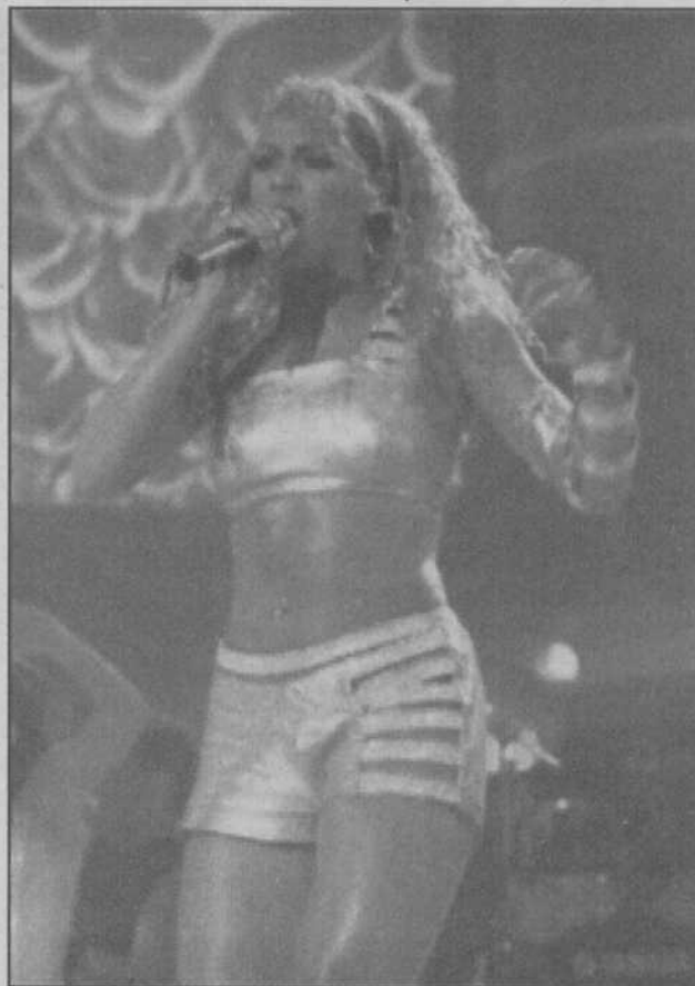
Beyonce Knowles heats up the Friday crowd.