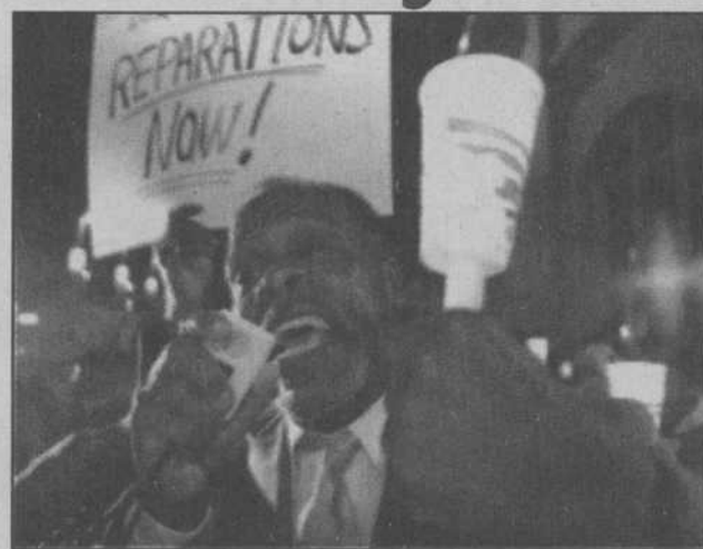
American actor Danny Glover takes part in a candlelight vigil at the World Conference Against Racism in Durban, South Africa, Wednesday. Glover, among several hundred people, staged the vigil in opposition to attempts to change the wording of the final declaration document.

Seeking to save the conference meant to develop an international plan to combat discrimination, the European Union, the Arab League and