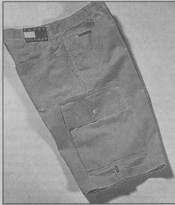
$48 Twill surplus short in stone and British khaki. Sizes 28-42.