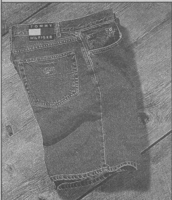
$39 50 Embroidered denim freedom short in vintage wash. Sizes 28-40.