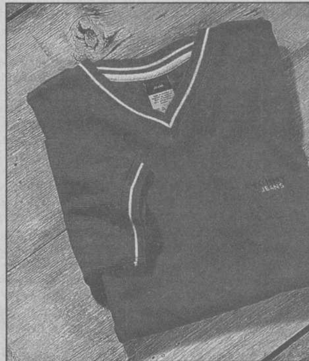
$24 V-neck ribbed tee in red, white, grey, navy, yellow and black. Sizes M-XXL.