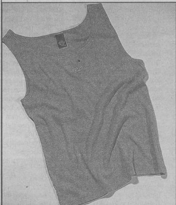
$16 Ribbed tank top in white, grey and red. Sizes S-XXL.