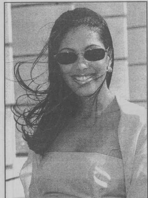
(Above) People shown in masse to star gaze. (Adjacent) "Live from LA" host Rachel was the recipient of many of those looks.