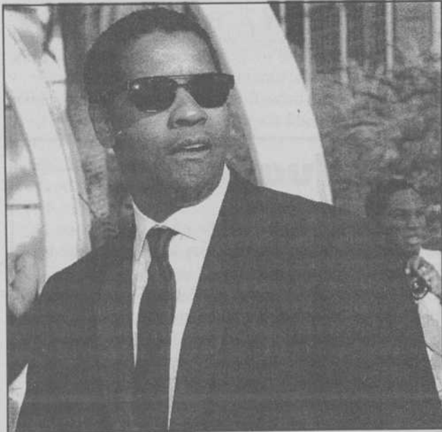
(Top) Denzel Washington exudes cool. (Below) Kenneth "Babyface" Edmonds holds his award.