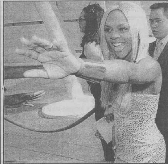
(Left photo) Actress Lisa Raye was among a bevy of stars offering BET 20th birthday wishes during an all-star gala last weekend at Bally's. (Adjacent photo) Rapper Lil' Kim was a crowd favorite.