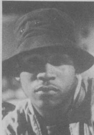
LL COOL J

"Oh man, this guy is mad, he's crazy. He's a straight out killer, who'll do anything to anybody who gets in his way. Playing him was a terrific experience because the role required me to reach inside of myself to places that I never knew existed. But that's what being an actor is all about - playing roles that are different from who you