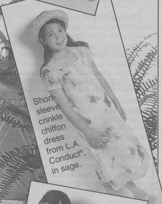
Short-sleeve crinkle chiffon dress from L.A. Conduct®, in sage.