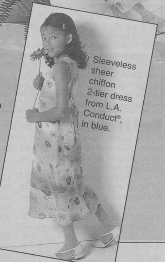
Sleeveless sheer chiffon 2-tier dress from L.A. Conduct®, in blue.