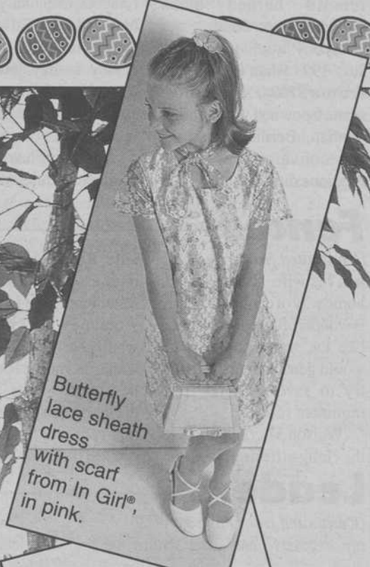
Butterfly lace sheath dress with scarf from In Girl®, in pink.