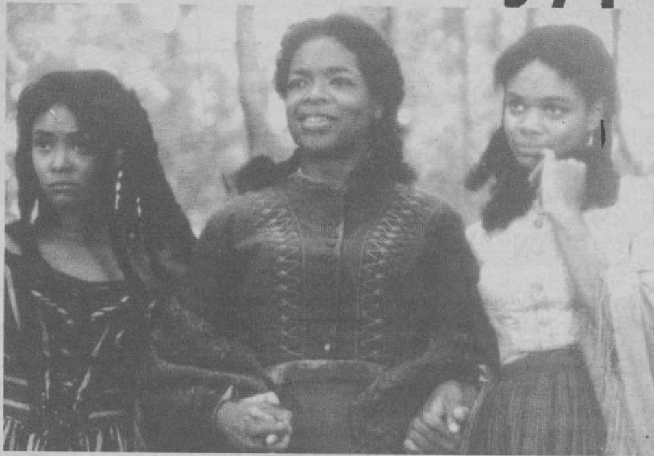
Oprah Winfrey (center) stars as Sethe, Thandie Newton (left) stars as Beloved and Kimberly Elise as Denver, in Touchstone Pictures' drama, "Beloved."

a scene befitting The Exorcist with the flying objects and the shakey surroundings. Into this supernatural setting enters Paul D. (Danny Glover), a friend of Sethe and a former slave on the Sweet Home Plantation.