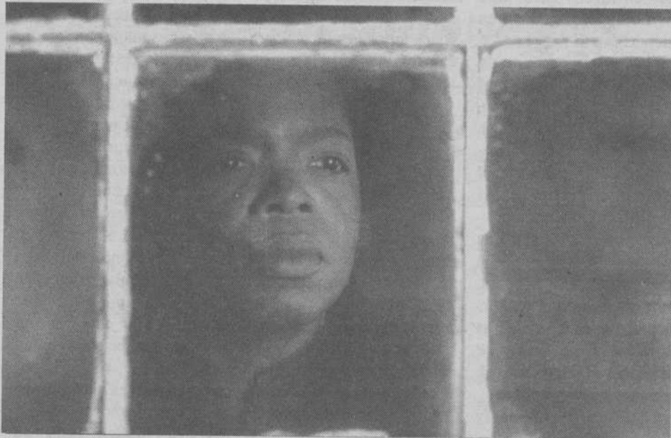
Oprah Winfrey stars as Sethe, an iron-willed former slave who must come to terms with her horric past and newly earned freedom, in Touchstone Pictures' drama, "Beloved."

Beloved is an achievement in film making that draws one deeply into its sadness, love, pain and mystery.