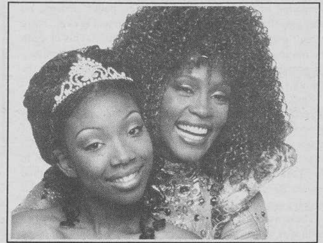
BRANDY NORWOOD AND WHITNEY HOUSTON

The big news from the business sector of Tinseltown is the news that Microsoft Corporation is close to an agreement to