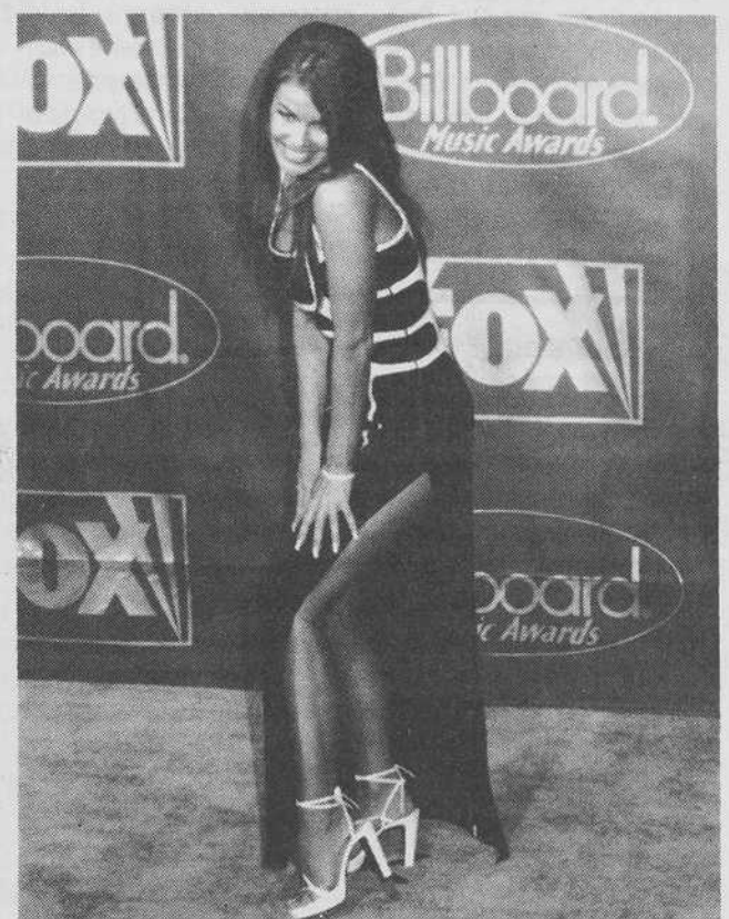
Clockwise from top right, R. Kelley, Prince protege Carmen Electra, Keith Sweat and Marian Carey and Brandy.