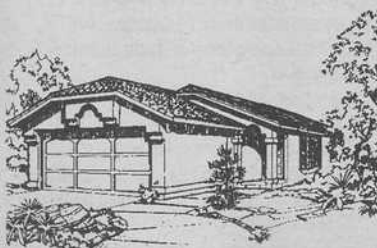
Model 2 "Sunburst" 1,325 Sq. Ft.

The Right Price. The Right Home. The Right Location. Right From The Start.