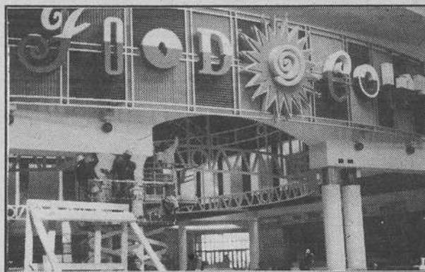
Workers recently apply finishing touches in the new Galleria's Food Court to open next week.