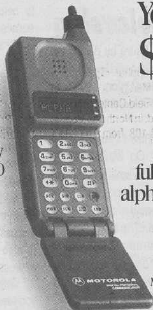
Motorola Alpha B Flip Phone

Both phones are fully featured with an alphanumeric electronic phone directory