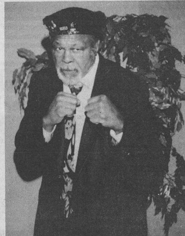
Archie "Ole Mongoose" Moore still has the old form...